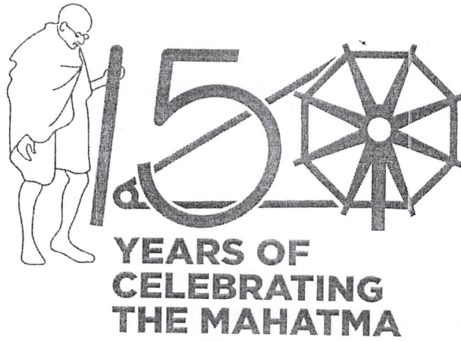
— 3. Logo in Bright Coloured - Reverse Form.jpg